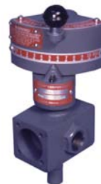
1" -O -400 SYNCHRO