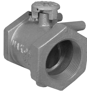
2-1/2" Series "BV" Valve

Series "BV" Balancing Valves are used to balance gas or air flows in multiple-burner systems fed by a common manifold. They feature a full-flow butterfly design with provision for locking in any position.