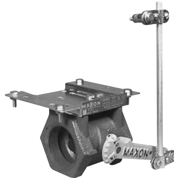
2" Series "CV" Valve with optional connecting base and linkage assembly

Versions available with UL (Underwriters Laboratories) listing for air, natural gas and liquefied petroleum gas service.