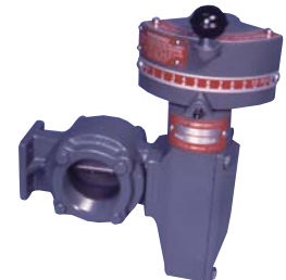
2-1/2" -M SYNCHRO Valve