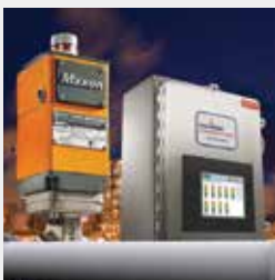
MAXON Series 8000 Safety Shut-off Valve paired with MAXON PSCHECK Partial Stroke technology

The Honeywell Thermal Solutions family of products includes Honeywell Combustion Safety, Honeywell Combustion Service, Eclipse, EXOTHERMICS, HAUCK, Kromschröder and MAXON.